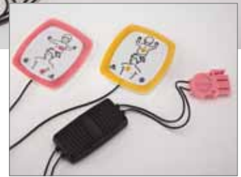
Infant/Child Reduced Energy Defibrillation Electrode Starter Kit

For use only with LIFEPAK® 500 Biphasic AED with pink connector or LIFEPAK 1000 defibrillator, LIFEPAK EXPRESS® AED, or LIFEPAK CR® Plus AED. For use on children less than 8 years of age or under 55 lbs.