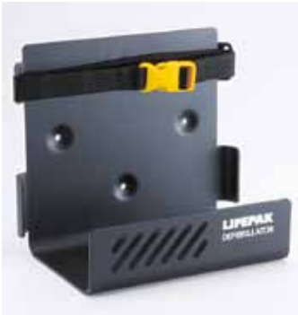
Wall Mount Bracket for LIFEPAK 1000 or LIFEPAK 500 Defibrillators 11210-000001