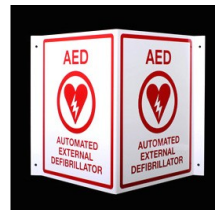
3-Way V Style